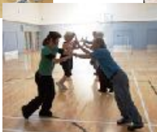
Bluebell Youth & Community Centre