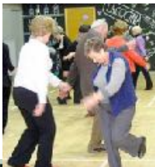
Terenure Sports Club (CYMS)