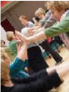
Clonliffe & Croke Park Community Centre

Clonliffe & Croke Park Community Centre Cabra Parkside Community & Sports Centre Irishtown Stadium Bluebell Youth & Community Centre Terenure Sports Club (CYMS) WFTRA Hall, Finglas West Carleton Hall, Marino