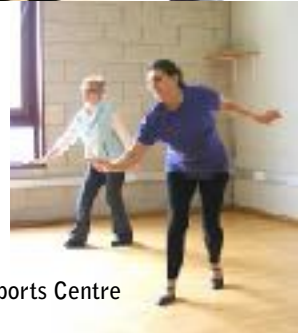
Cabra Parkside Community & Sports Centre