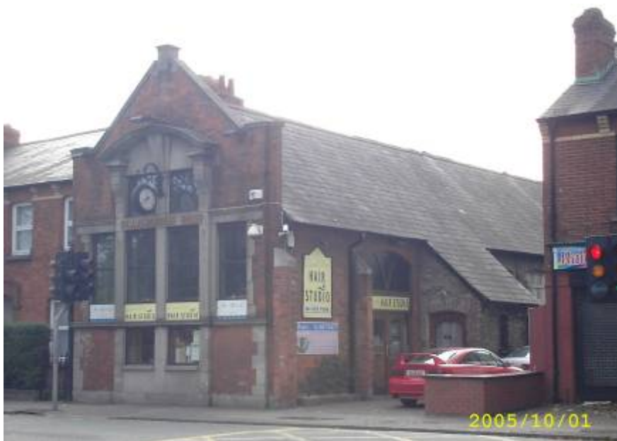
Figure 7/31 – Fairview Former P.O., c.1889; Photo, Author, 2005