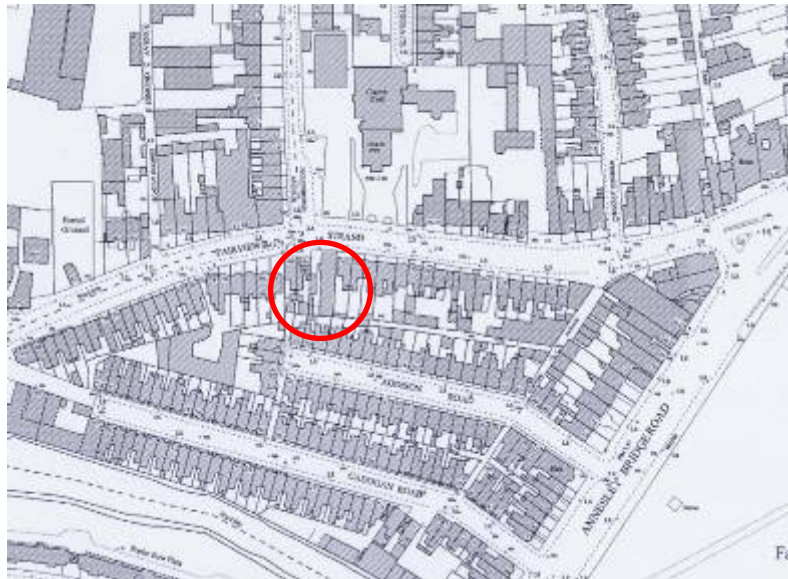
Figure 7/30 – Fairview Former P.O., 1889; Base Map Source: Ordnance Survey Ireland 295

This former post office building is located on the south side of Fairview Strand opposite the junction of Philipsborough Avenue, Figure 7/30 and 7/31. It is a detached building located between a row of terraced two storey brick houses to the east side and two semi-detached two-storey shop units, of a later period, to the west side.