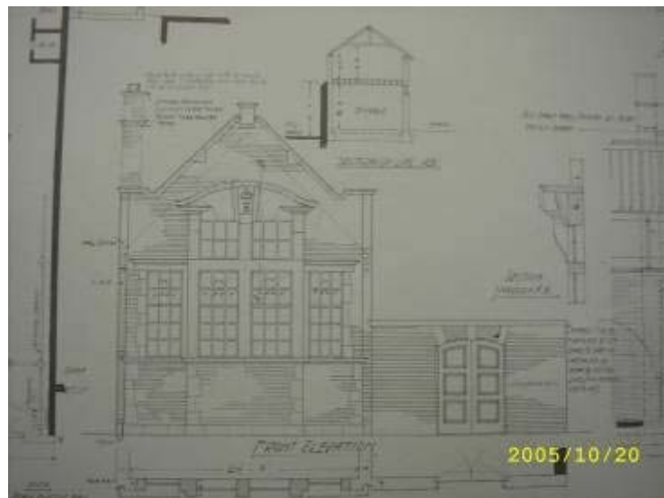
Figure 7/33 – Fairview P.O., c. 1889; Original Front Elevation Drawing 297

The front façade differs from the original elevation drawing as the brickwork below the front windows is now stone, Figure 7/33.